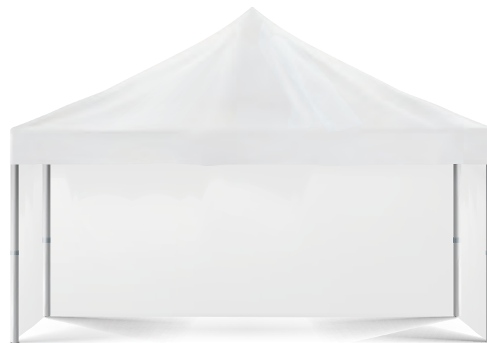
18 sqm (3m x 6m)