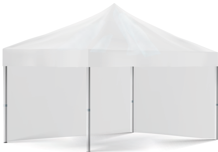
9 sqm (3m x 3m)